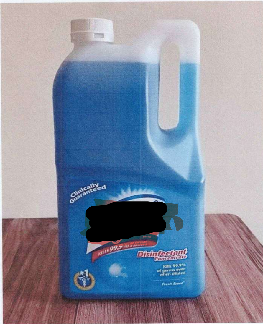
Concentrated Disinfectant (gallon)