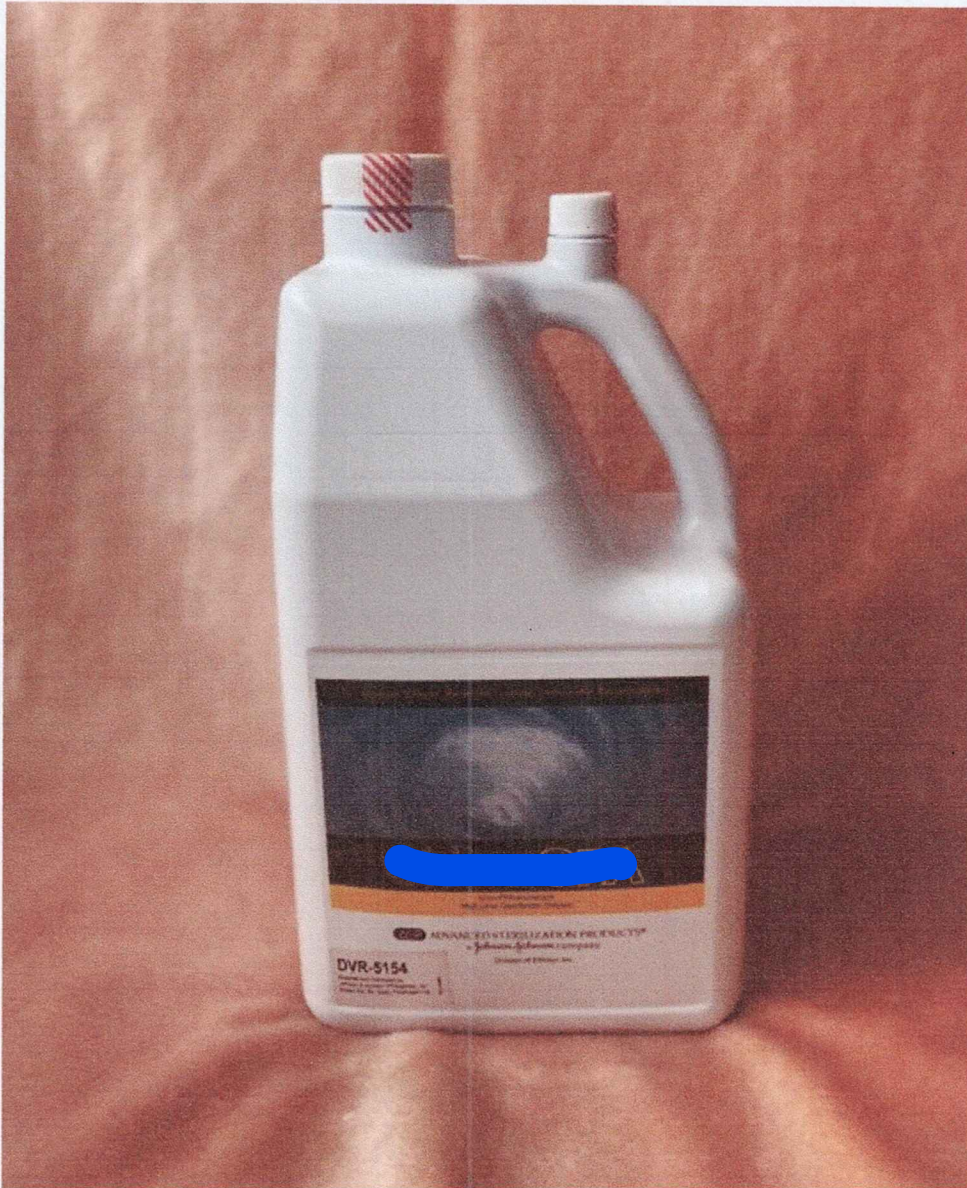
[REDACTED] Sterilizing Solution (gallon)